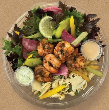
Grilled Shrimp 25.95