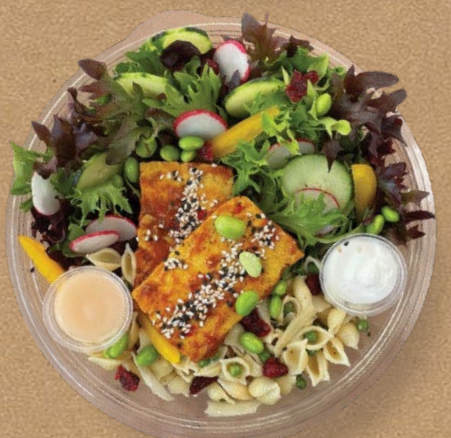
Tofu | Maple syrup 20.95