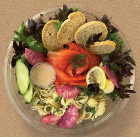
Smoked Salmon 26.95