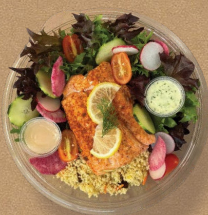
Salmon Filet 22.95