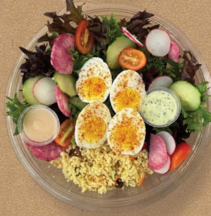
Two Eggs 20.95