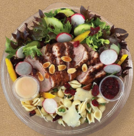
Duck Breast 27.95 Sold in Pair