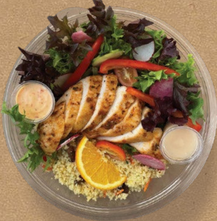
Chicken Breast 22.95